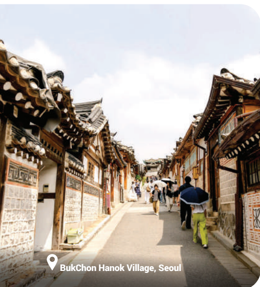
BukChon Hanok Village, Seoul