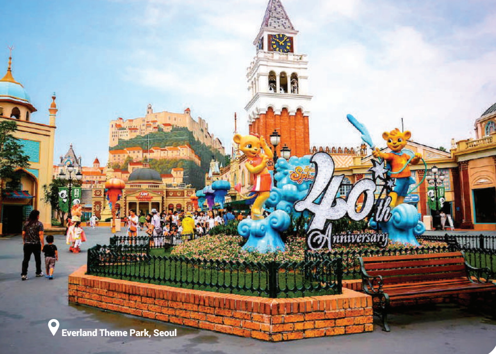
Everland Theme Park, Seoul