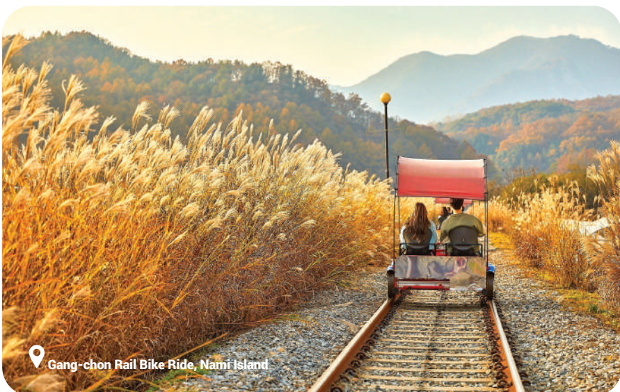
📍 Gang-chon Rail Bike Ride, Nami Island