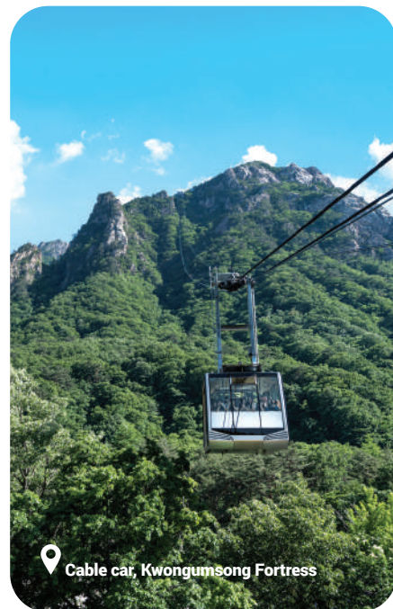
📍 Cable car, Kwongumsong Fortress