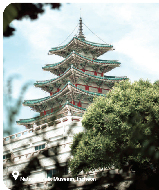
📍 National Folk Museum, Incheon