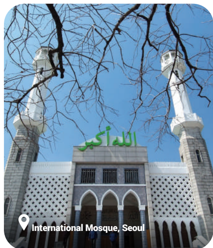
📍 International Mosque, Seoul