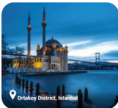
Ortakoy District, Istanbul