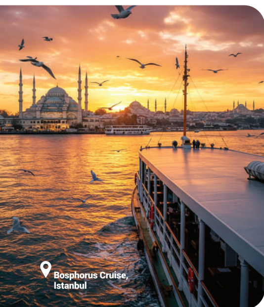
Bosphorus Cruise, Istanbul