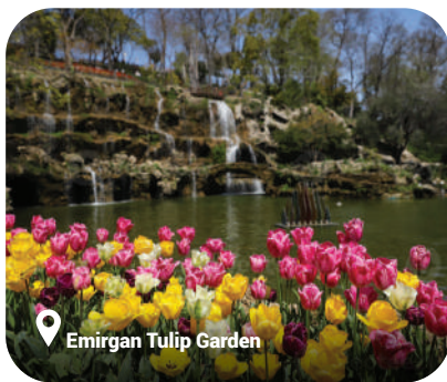
Emirgan Tulip Garden