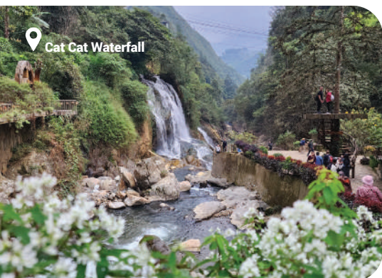
Cat Cat Waterfall