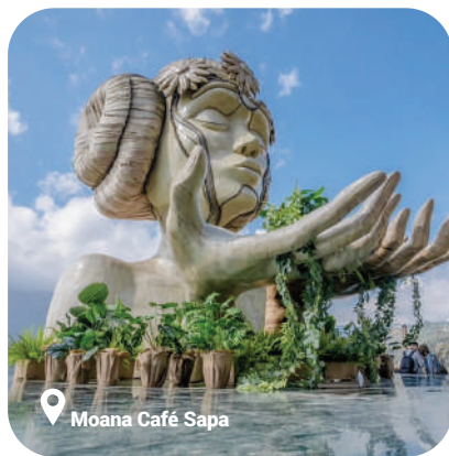
Moana Café Sapa