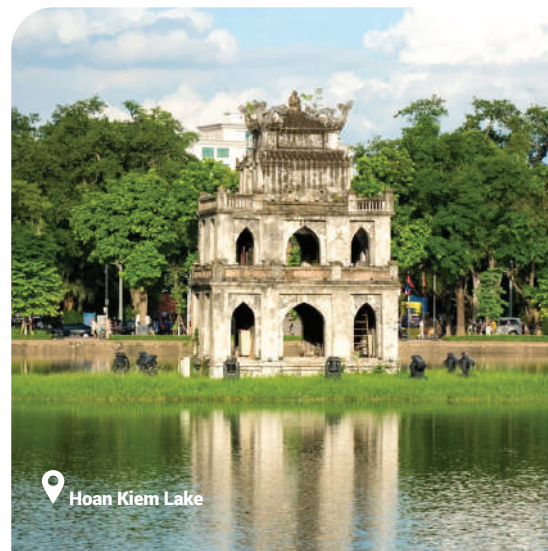
Hoan Kiem Lake