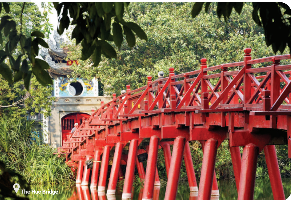
The Huc Bridge

Notes: The itinerary may be subject to change due to unforeseen circumstances and without prior notice.