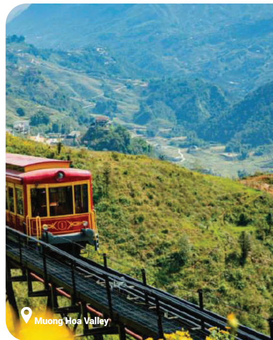
Muong Hoa Valley